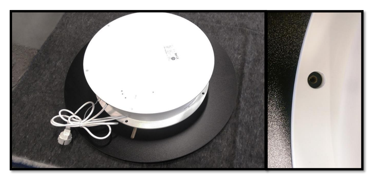
Step 2: Placing the turntable (upside down) on the (already upturned) presentation disc

Put the turntable upside down on the presentation disc. Move the turntable in the correct position: with the holes in the outer edge right above the holes in the presentation disc. The turntable is then centered exactly in the middle of the disc. If you have a turntable with a revolving power source, you need to make sure that its wire falls into the slot of the presentation disc.