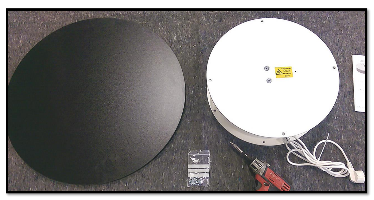
Step 1: Check whether you have all the following items in front of you

Guideline for mounting a presentation disc on your turntable