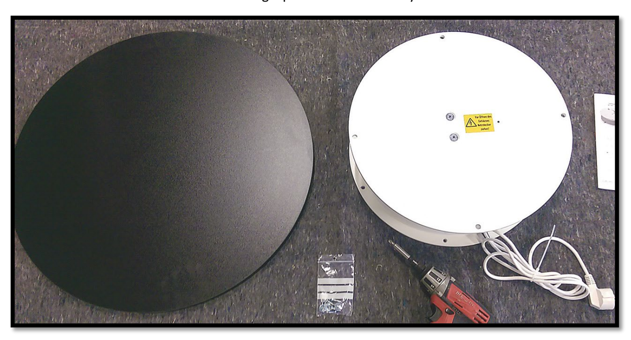
Step 1: Check whether you have all the following items in front of you

Guideline for mounting a presentation disc on your turntable